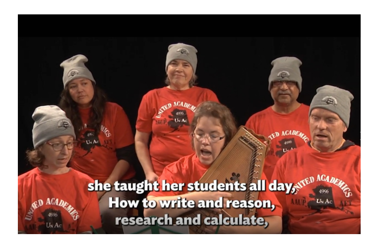
Photo: Faculty singing a <u>UA version of the "Union Maid"</u> song

Acts of support such as this resolution from UAA's student governance, along with visible faculty solidarity and vocal support from legislators and union allies, helped us ultimately reach the TA'd contract that is currently up for ratification.