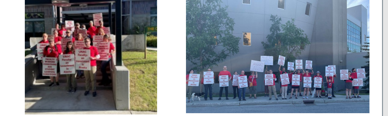
UAA faculty rallied during the June 2022 BOR meeting