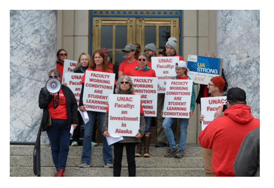
UAS faculty rallied outside the state capitol in late June 2022